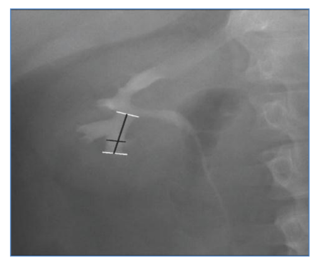
Fig. 2. Measuring lower pole infundibular length in 10 min. Excretory urogram (EU) film

residual stone and they were managed with another treatment line.