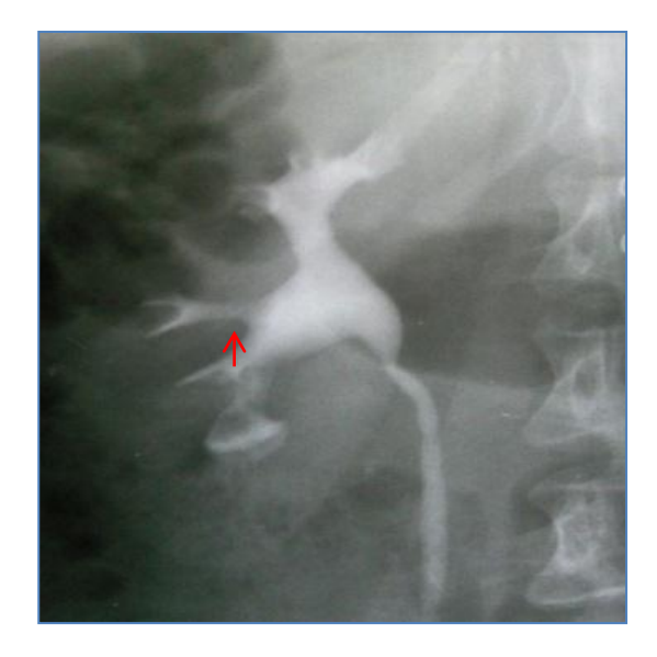
Fig. 1. X-ray (kidney, ureter and bladder) and excretory urogram showing lower pole stone.