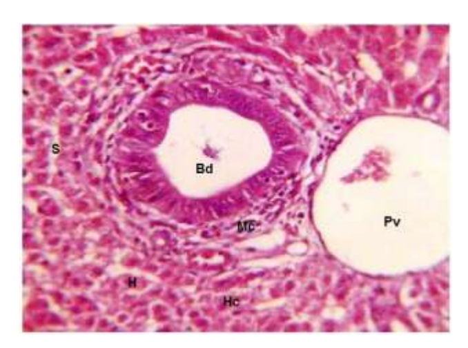
Figure 3: Section of liver tissue of group III (MTX 20 mg/kg +felodipine 0.5mg/kg) on day 8 of the experiment, shows mild portal inflammation. H & E stain, (40X). H: hepatocyte, Hc: hepatic cord, S: sinusoid, Pv: portal vein, Mc: mononuclear cells infiltrate.

that it acted as a superoxide scavenger. The attenuation of intracellular calcium by felodipine can also modulate free radicals and inflammatory mediators production <sup>(34)</sup>.