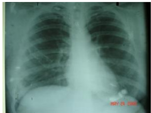
Figure 1: (PA chest x-ray) shows widening 4 th rib on right side with osteolytic changes in favor of osteomyelitis.

Chest X-rays showed an osteolytic lesion on the 4th right rib (Figure 1). The lung parenchyma and mediastinum were free.